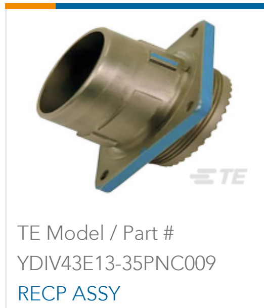
TE Model / Part # YDIV43E13-35PNC009 RECP ASSY