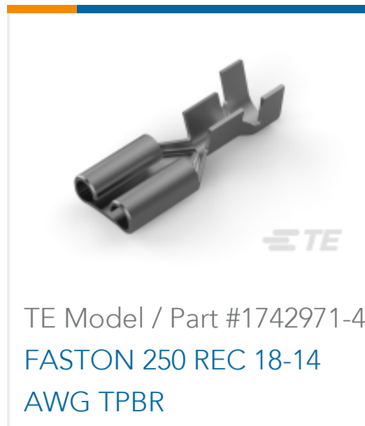
TE Model / Part #1742971-4 FASTON 250 REC 18-14 AWG TPBR