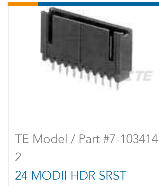
TE Model / Part #7-103414-2 24 MODII HDR SRST SHRD .100CL