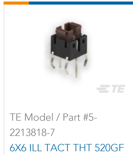
TE Model / Part #5-2213818-7 6X6 ILL TACT THT 520GF HI BLUE