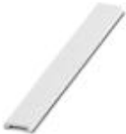
Zack Marker strip, flat, can be ordered: Strip, white, labeled according to customer specifications, mounting type: snap into flat marker groove, for terminal block width: 5 mm, lettering field size: 5.15 x 5.15 mm

Zack Marker strip, flat - ZBF 5 CUS - 0825025