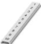
Zack Marker strip, flat, Strip, white, labeled, Printed vertically: consecutive numbers 1 ... 10, 11 ... 20, etc. up to 91 ... 100, mounting type: snap into flat marker groove, for terminal block width: 5 mm, lettering field size: 5.15 x 5.15 mm

Zack Marker strip, flat - ZBF 5,QR:FORTL.ZAHLEN - 0808697