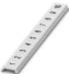
Zack Marker strip, flat, Strip, white, labeled, printed horizontally: consecutive numbers 1 ... 10, 11 ... 20, etc. up to 491 ... 500, mounting type: snap into flat marker groove, for terminal block width: 5 mm, lettering field size: 5.15 x 5.15 mm

Zack Marker strip, flat - ZBF 5,LGS:FORTL.ZAHLEN - 0808671