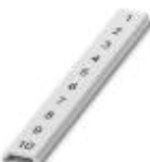
Zack Marker strip, flat, Strip, white, labeled, Printed vertically: consecutive numbers 1 ... 10, 11 ... 20, etc. up to 91 ... 100, mounting type: snap into flat marker groove, for terminal block width: 5 mm, lettering field size: 5.15 x 5.15 mm

Zack Marker strip, flat - ZBF 5,QR:FORTL.ZAHLEN - 0808697