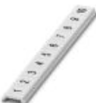
Zack Marker strip, flat, Strip, white, labeled, printed horizontally: consecutive numbers 1 ... 10, 11 ... 20, etc. up to 491 ... 500, mounting type: snap into flat marker groove, for terminal block width: 5 mm, lettering field size: 5.15 x 5.15 mm

Zack Marker strip, flat - ZBF 5,LGS:FORTL.ZAHLEN - 0808671