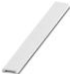
Zack Marker strip, flat, can be ordered: Strip, white, labeled according to customer specifications, mounting type: snap into flat marker groove, for terminal block width: 5 mm, lettering field size: 5.15 x 5.15 mm

Zack Marker strip, flat - ZBF 5 CUS - 0825025