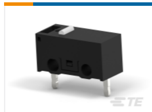
TE Model / Part # 2351444-5 UMINSA SW PPLUN 0.88N 3A/1.5A AC NC PCB