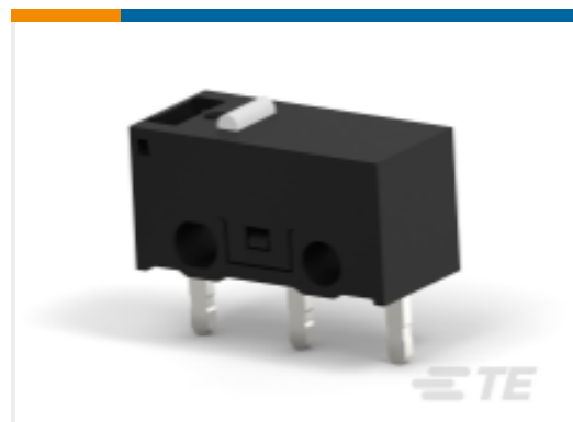
TE Model / Part # 2351444-4 UMINSA SW PPLUN 0.88N 3A/1.5A AC SC PCB