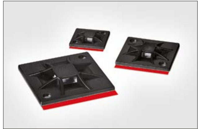
Mounting bases Q-Mount.