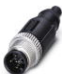
M12 blind plug for sensor circuit from PSR-CT safety circuits, pin 1 bridged to pins 2 and 4

Short-circuit connector - SAC-5P-M12MS BK BR 1-2-4 - 1054366