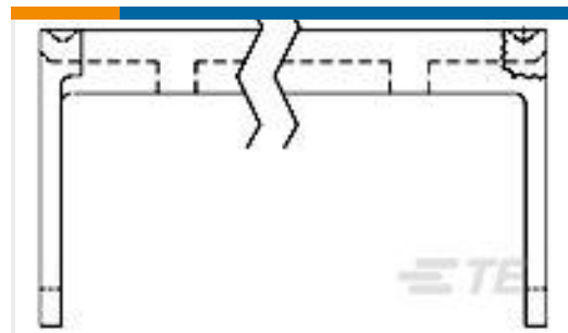
TE Part #2-1437024-8 622-2631=FSKT IDC S 26 SR