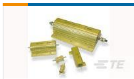
TE Part #7-1625971-3 HSA25 R015 5%