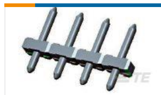
TE Part #1546931-5 5P UNSHROUD 5.0 HDR,HIGH TEMP