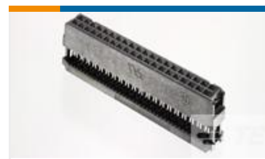
TE Part #1658623-9 40 NOVO MIL 30DP, LEAD FREE