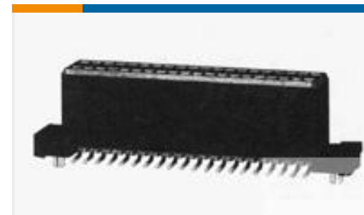
TE Part #104550-6 50 SYS50 SURFMNT DRST RCPT