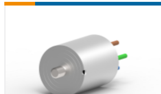
TE Part #8-6609089-1 16WGF3=F8248E