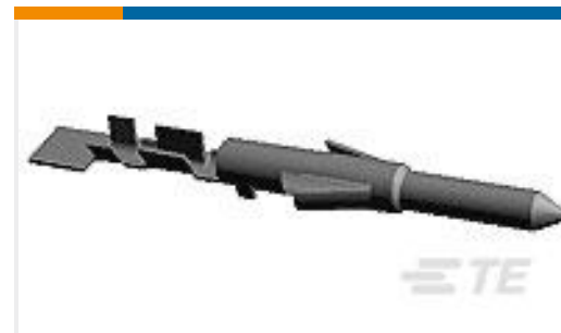
TE Part #207438-2 CONTACT,PIN,AUDIO MICRO