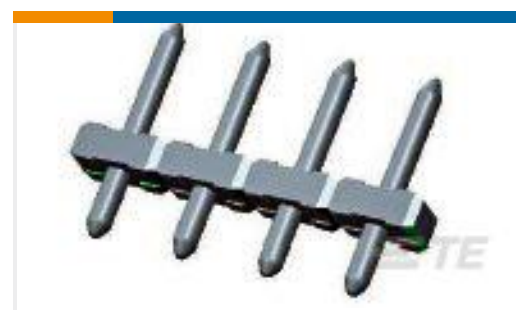
TE Part #1546931-2 2P UNSHROUD 5.0 HDR,HIGH TEMP