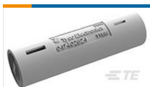
TE Part #1740262-2 NECTOR S OUTLET HV-1 BLACK