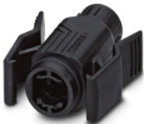
RJ45 sleeve housing, IP67, for pin insert VS-08-ST-H11-RJ45 and VS-08-ST-H21-RJ45, with push-pull interlocking for panel mounting frames, for cable cross section 5.0 mm ... 8.5 mm, color: black

Please be informed that the data shown in this PDF Document is generated from our Online Catalog. Please find the complete data in the user's documentation. Our General Terms of Use for Downloads are valid ( http://phoenixcontact.com/download )