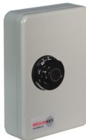
System 30 Dial Combination Lock