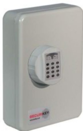
System 30 Electronic Lock REVO A