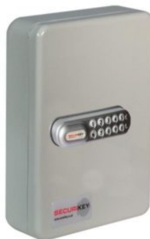
System 30 CL1000 Electronic Cam Lock