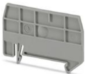
Partition plate, length: 59.8 mm, width: 2 mm, height: 39 mm, color: gray

Please be informed that the data shown in this PDF Document is generated from our Online Catalog. Please find the complete data in the user's documentation. Our General Terms of Use for Downloads are valid ( http://phoenixcontact.com/download )