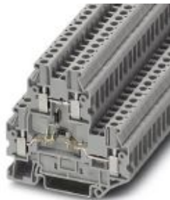
Component terminal block, with integrated diode, connection method: Screw connection, cross section: 0.14 mm 2 - 4 mm 2 , AWG: 26 - 12, width: 5.2 mm, color: gray, mounting type: NS 35/7,5, NS 35/15

Please be informed that the data shown in this PDF Document is generated from our Online Catalog. Please find the complete data in the user's documentation. Our General Terms of Use for Downloads are valid ( http://phoenixcontact.com/download )