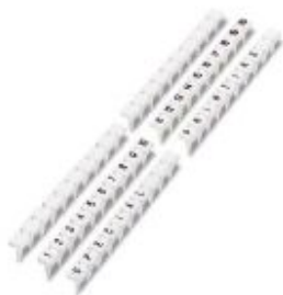
BNB Zack marker strip, 10-section, divisible, horizontally labeled with the consecutive numbers: 21 ... 30, white

Please be informed that the data shown in this PDF Document is generated from our Online Catalog. Please find the complete data in the user's documentation. Our General Terms of Use for Downloads are valid ( http://phoenixcontact.com/download )