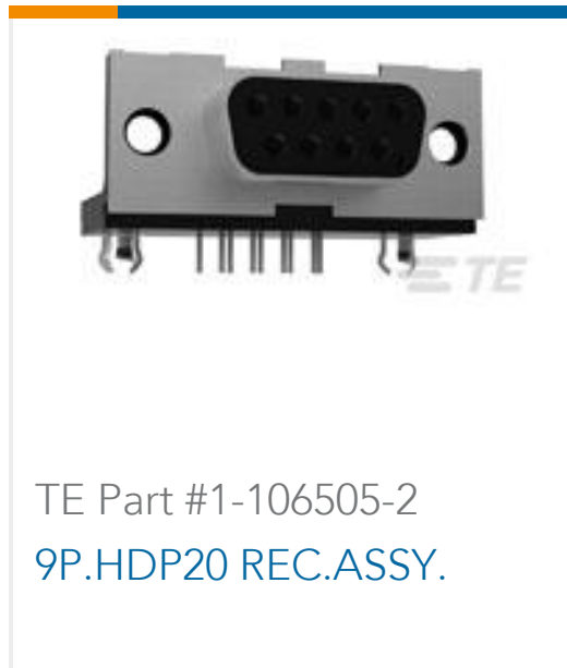
TE Part #1-106505-2 9P.HDP20 REC.ASSY.