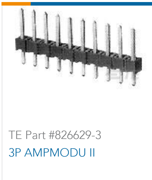
TE Part #826629-3 3P AMPMODU II