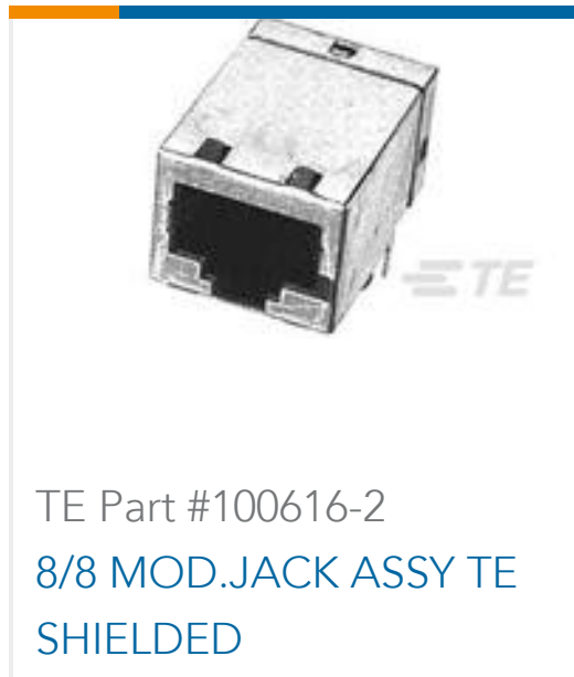
TE Part #100616-2 8/8 MOD.JACK ASSY TE SHIELDED