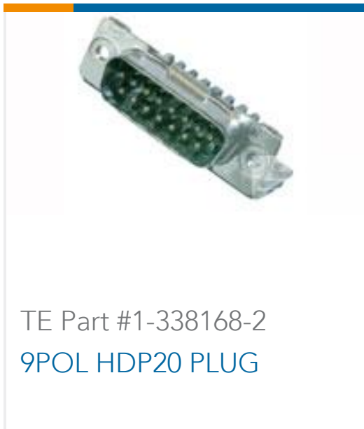
TE Part #1-338168-2 9POL HDP20 PLUG