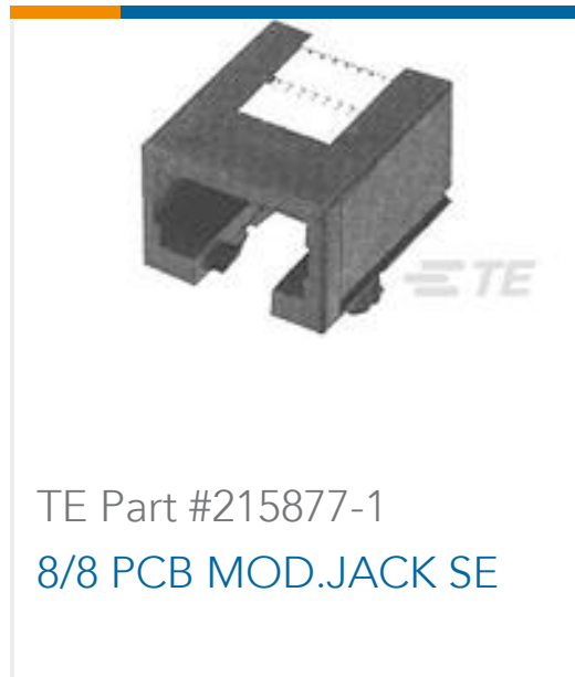
TE Part #215877-1 8/8 PCB MOD.JACK SE