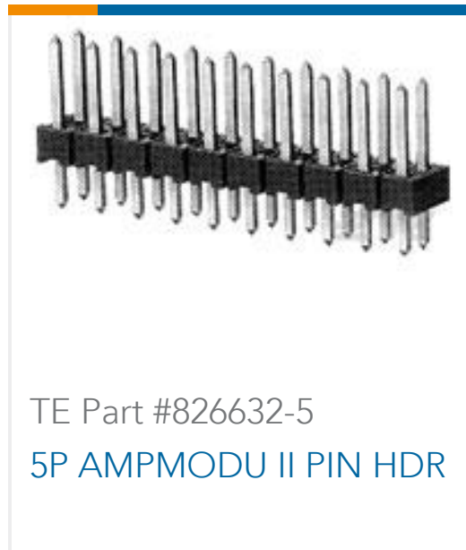
TE Part #826632-5 5P AMPMODU II PIN HDR