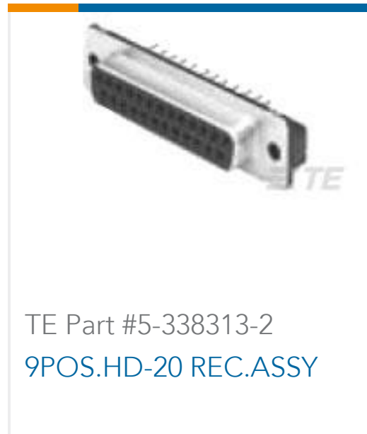
TE Part #5-338313-2 9POS.HD-20 REC.ASSY