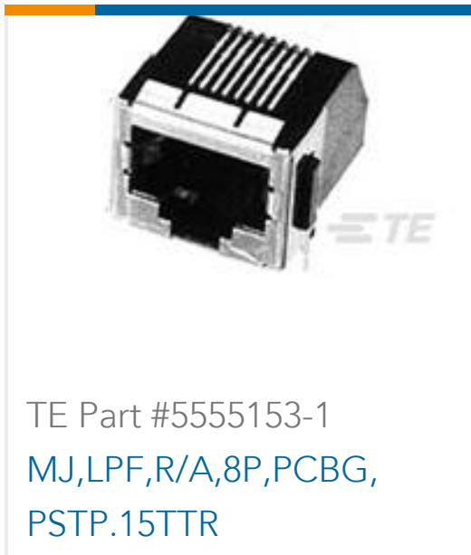
TE Part #5555153-1 MJ,LPF,R/A,8P,PCBG, PSTP.15TTR