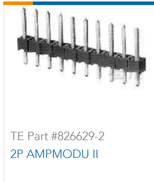
TE Part #826629-2 2P AMPMODU II