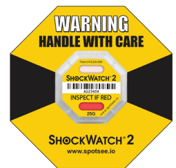
ShockWatch 2 with ring label.