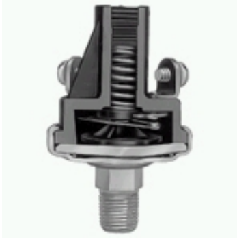
Actual product appearance

5000 Series pressure switch with standard terminal