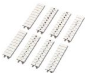
Zack marker strip, 10-section, vertically labeled with the consecutive numbers: 71 ... 80, white, width: 5 mm

Please be informed that the data shown in this PDF Document is generated from our Online Catalog. Please find the complete data in the user's documentation. Our General Terms of Use for Downloads are valid ( http://phoenixcontact.com/download )