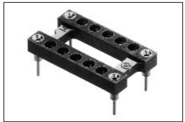
Note: Aries specializes in custom design and production. In addition to the standard products shown on this page, special materials, platings, sizes, and configurations can be furnished, depending on quantities. Aries reserves the right to change product specifications without notice.