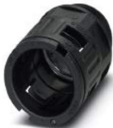
Cable gland, Pg thread, IP66 protection, straight

Please be informed that the data shown in this PDF Document is generated from our Online Catalog. Please find the complete data in the user's documentation. Our General Terms of Use for Downloads are valid ( http://phoenixcontact.com/download )