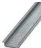
DIN rail, material: Galvanized, unperforated, height 7.5 mm, width 35 mm, length: 2 m

DIN rail, unperforated - NS 35/ 7,5 ZN UNPERF 2000MM - 1206434