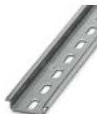
DIN rail, material: Galvanized, perforated, height 7.5 mm, width 35 mm, length: 2 m

DIN rail perforated - NS 35/ 7,5 ZN PERF 2000MM - 1206421