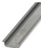
DIN rail, unperforated, Width: 35 mm, Height: 7.5 mm, Length: 2000 mm, Color: silver

DIN rail, unperforated - NS 35/ 7,5 AL UNPERF 2000MM - 0801704