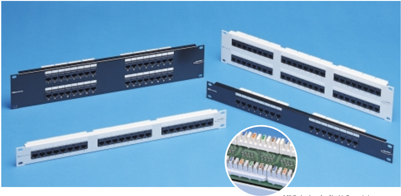
PCB Technology for Gigabit Transmission

Brand-Rex 19" (483mm) GigaPlus rack mounted patch panel offers a proven Enhanced Category 5 performance using patented state of the art printed circuit technology. All outlets are numerically identified with an additional writeable surface for ease of port naming. Each panel is supplied with cable ties, panel mounting accessories and installation instructions.