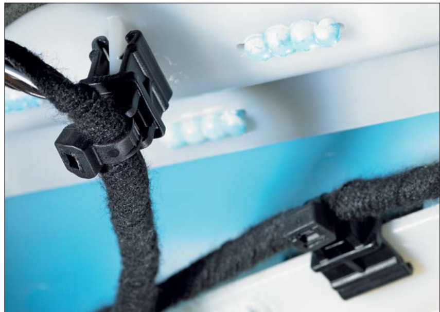
T50ROSEC10 fitted onto a plastic panel to hold a Ø 6mm harness.

These cable ties and Edge Clip assemblies are ideal for use where holes are not acceptable or where due to temperature problems adhesives will fail. These assemblies are widely used for fixing and bundling cables, pipes and hoses within the automotive industry, harness making, panel building and electrical industry.