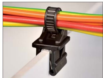
1-Piece-Fixing Tie T50SOSEC12 can be pushed easily on edges.