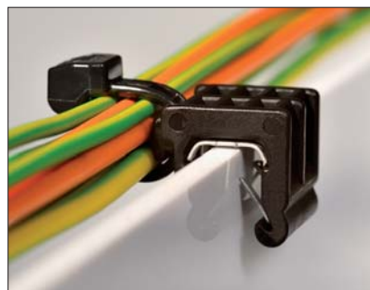
T50ROSEC23 - the cable bundle runs parallel with the edge.