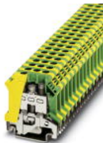
Ground terminal block with screw connection, cross section: 0.5 - 6 mm 2 , AWG: 20 - 8, width: 8.2 mm, color: green-yellow

Please be informed that the data shown in this PDF Document is generated from our Online Catalog. Please find the complete data in the user's documentation. Our General Terms of Use for Downloads are valid ( http://download.phoenixcontact.com )