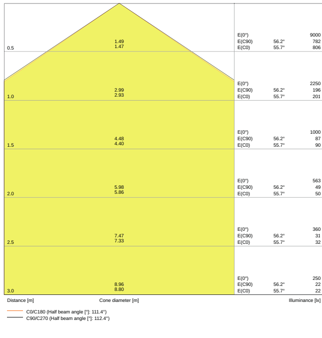
LDC typ cone