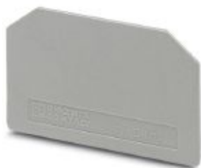
End cover, length: 46 mm, width: 1 mm, height: 28.7 mm, color: gray

Please be informed that the data shown in this PDF Document is generated from our Online Catalog. Please find the complete data in the user's documentation. Our General Terms of Use for Downloads are valid ( http://phoenixcontact.com/download )