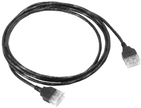
AX101945 GigaBIX PS6+ Patch Cord, BIX-BIX, 4 ft