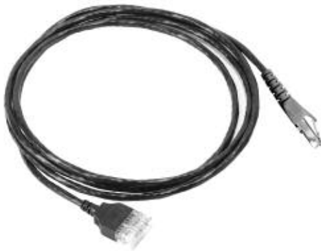
AX101951 GigaBIX PS6+ Patch Cord, BIX-8MOD, 4 ft

GigaBIX PS6+ Patch Cords increase the proven versatility of the expanded GigaBIX Multi family of connectivity products. GigaBIX PS6+ Patch Cords allow for high-density connections, coupled with flexibility for cost-effective installation and administration. Plug-and-go installation and rearrangement of patch cords do not require any special tools or training.