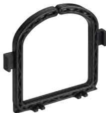
AX101478 GigaBIX Management Ring