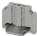
End clamp, width: 9.5 mm, color: gray