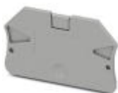
End cover, length: 50.8 mm, width: 2.2 mm, height: 35.3 mm, color: gray