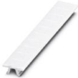
Zack marker strip, 10-section, horizontally labeled with the identical number: 2, white, width: 6 mm

Please be informed that the data shown in this PDF Document is generated from our Online Catalog. Please find the complete data in the user's documentation. Our General Terms of Use for Downloads are valid ( http://phoenixcontact.com/download )