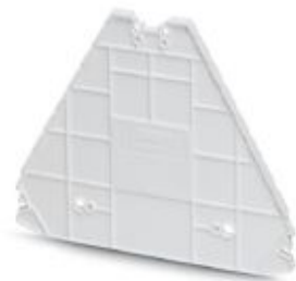
End cover, length: 100 mm, width: 3.8 mm, height: 80.8 mm, color: white

Please be informed that the data shown in this PDF Document is generated from our Online Catalog. Please find the complete data in the user's documentation. Our General Terms of Use for Downloads are valid ( http://phoenixcontact.com/download )