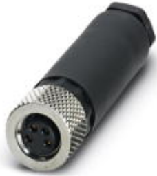
Connector, Universal, 4-position, Socket straight M8, A-coded, Screw connection, knurl material: Nickel-plated brass, external cable diameter 3.5 mm ... 5 mm

Please be informed that the data shown in this PDF Document is generated from our Online Catalog. Please find the complete data in the user's documentation. Our General Terms of Use for Downloads are valid ( http://phoenixcontact.com/download )