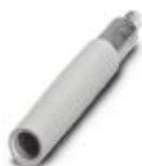
Female test connector, color: white

Female test connector - PSBJ-URTK 6 WH - 3026448