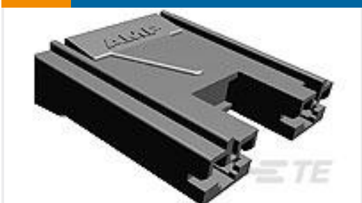
TE Part #353148-5 POSITIVE LOCK 187 HOUSING RECEPTACLE