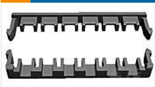
TE Part #1376396-1 5MM POWER KEY D/L PLATE GREEN