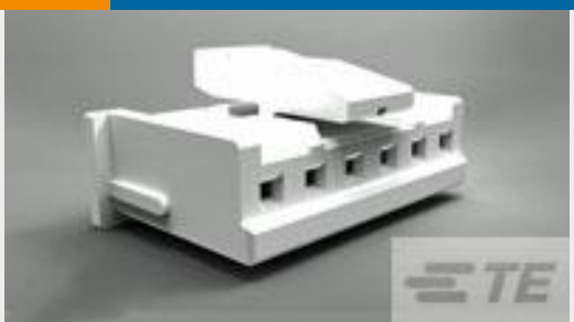
TE Part #1969442-7 EP 2.5 TPA Housing, 7 Pos