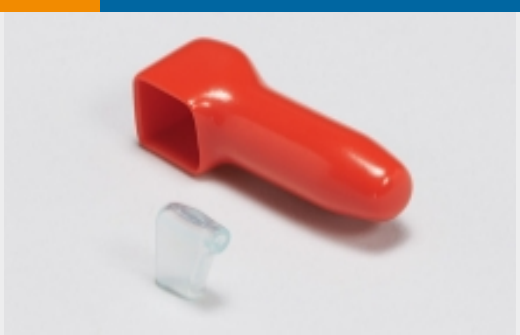
Insulation Boots & Sleeves(7)