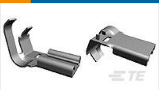
TE Part #1742626-1 250 FASTON,FLAG,REC.,16-14 AWG, NPST