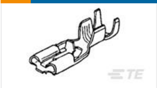
TE Part #170324-1 187 PL MKII REC. 24-20AWG PTBR