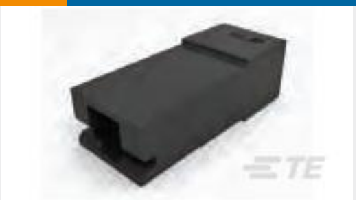
TE Part #1969632-1 250 FASTON HSG.,REC.,1 POS,BLACK