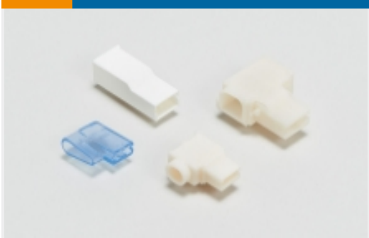
Crimp Terminal Housings(86)