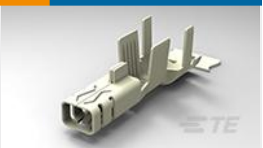
TE Part #1971787-2 PTL RECEPTACLE CONTACT, 2X18 AWG