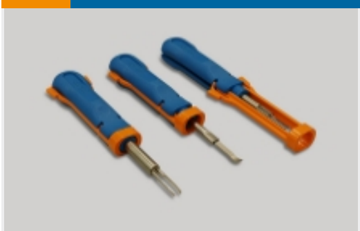
Insertion & Extraction Tools(2)