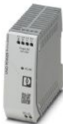
Primary-switched UNO POWER power supply for DIN rail mounting, input: 1-phase, output: 15 V DC/55 W

Please be informed that the data shown in this PDF Document is generated from our Online Catalog. Please find the complete data in the user's documentation. Our General Terms of Use for Downloads are valid ( http://phoenixcontact.com/download )