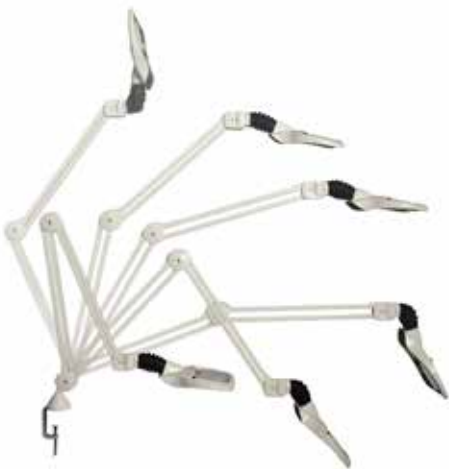
Self-balancing, friction-free arm.

The flexibility of the self-balancing arm and friction-free joint between the lamp head and arm makes exact positioning easy.