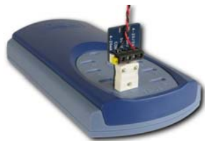
Figure 2: The terminal board fitted to the USB TC-08

The voltage displayed in PicoLog corresponds to the input voltage as follows: