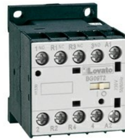
Auxiliary contactor BG09