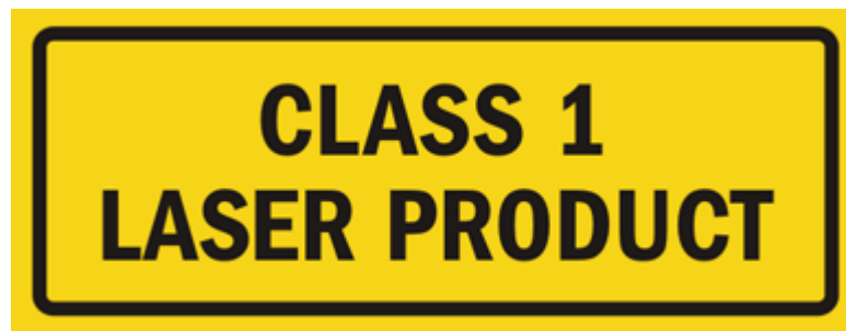
Figure 1. Class 1 laser product label

The VL53L0X contains a laser emitter and the corresponding drive circuitry. The laser output is designed to remain within Class 1 laser safety limits under all reasonably foreseeable conditions including single faults in compliance with IEC 60825-1:2014 (third edition). The laser output will remain within Class 1 limits as long as the STMicroelectronics recommended device settings are used and the operating conditions specified in the STM32L4+ datasheets are respected. The laser output power must not be increased by any means and no optics should be used with the intention of focusing the laser beam. Figure 1 shows the warning label for Class 1 laser products.