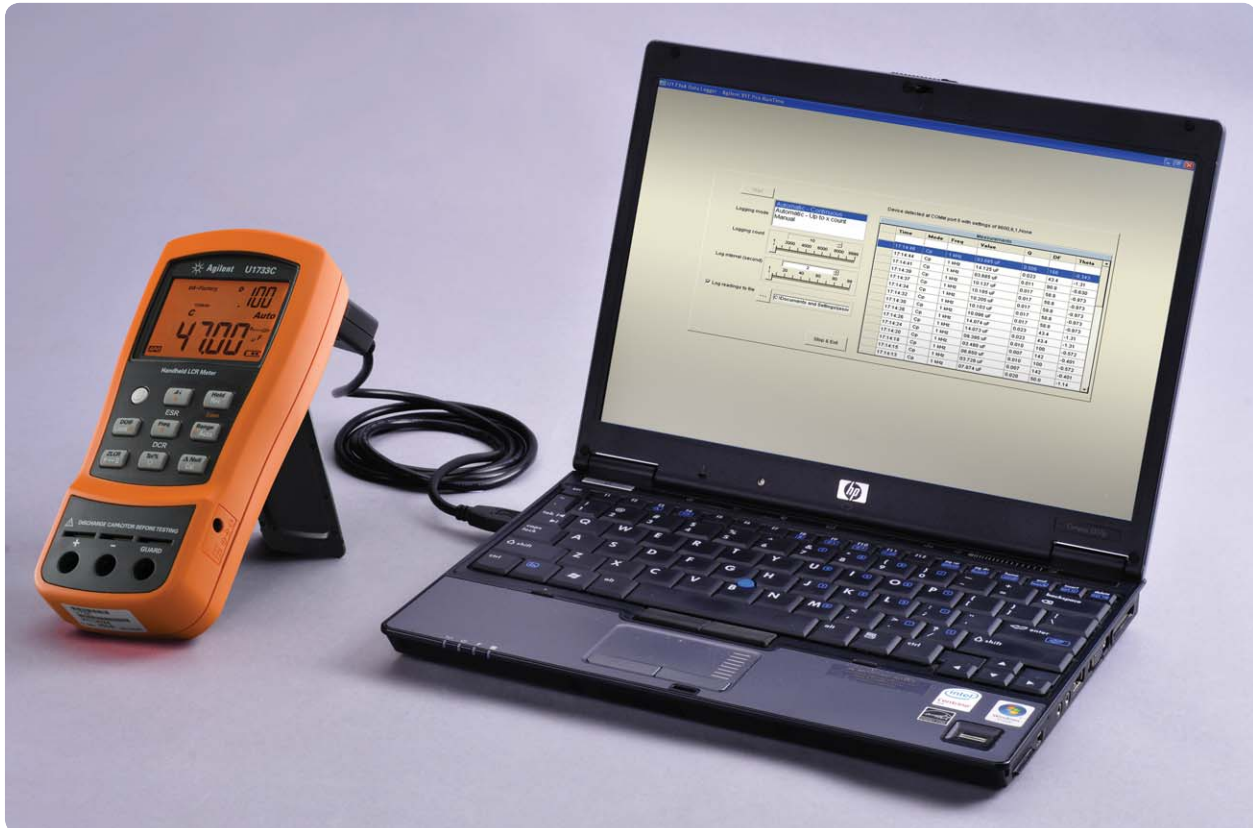
Figure 1. Automate the recording of continuous readings when you hook the U1731C/U1732C/U1733C to a PC

The handheld LCR meters allows you to test various component types, including secondary components of Dissipation Factor (D), Quality Factor (Q), and Angle Indication of Impedance ( \theta ). This new handheld series also includes other functions that result in a more detailed component analysis. For example, the built-in Equivalent Series Resistance (ESR) function helps you better understand the inherent resistance behavior typically found in capacitors across selected frequencies. DCR is a built-in DC resistance measurement that eliminates the use of a separate digital multimeter (DMM) for component test.