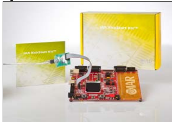
Figure 2. Starter kit

IAR KickStart kits are available for a full range of ST ARM core-based microcontrollers.