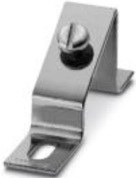
Angled brackets with M 6 screw, for fixing DIN rails at an angle of 30°, height: 35.4 mm

Please be informed that the data shown in this PDF Document is generated from our Online Catalog. Please find the complete data in the user's documentation. Our General Terms of Use for Downloads are valid ( http://phoenixcontact.com/download )