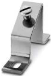
Angled brackets with M6 screw, for fixing DIN rails at an angle of 30°, height: 46 mm

Please be informed that the data shown in this PDF Document is generated from our Online Catalog. Please find the complete data in the user's documentation. Our General Terms of Use for Downloads are valid ( http://phoenixcontact.com/download )