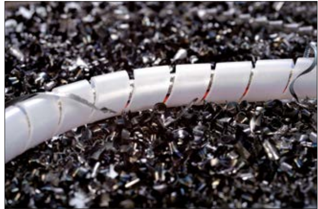
SPBA spiral binding made of polyamide offers excellent protection against abrasion.