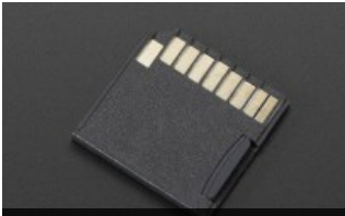
Black Shortening microSD