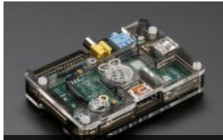
Modela Ninja PiBow -