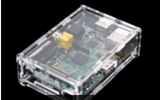
Adafruit Pi Box - Enclosure