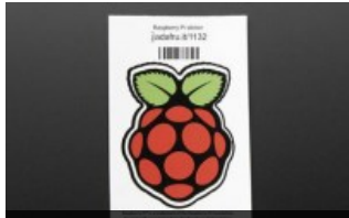
Raspberry Pi® - Sticker