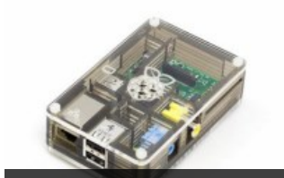
Ninja PiBow - Enclosure for