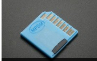
Blue Shortening microSD