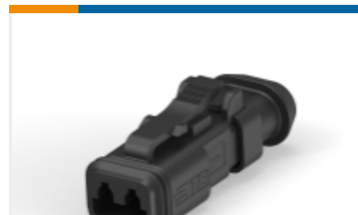
TE Part #1-2600023-9 2CCT BLACK PLUG W/SMALL SEAL & HS