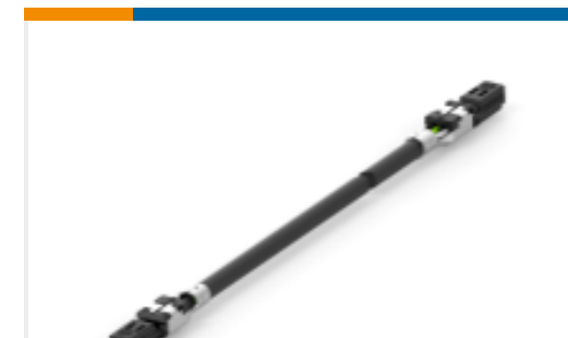
TE Part #1-2362764-0 MATENET,CABLE ASSY,1 GBPS UTP HS