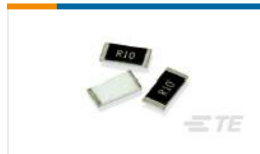
TE Part #2176052-8 RLP73N 1J R10 5% 5K RL