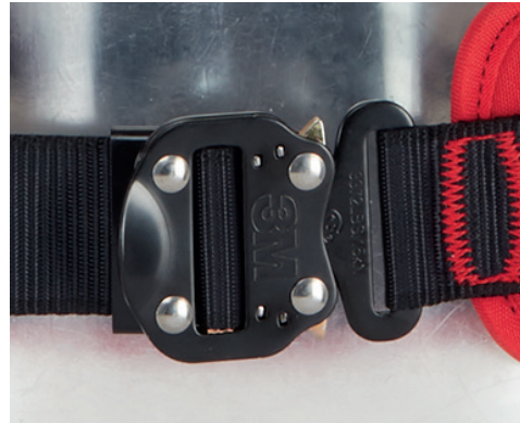
Quick connect buckles