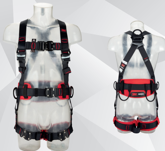
Comfort belt, horizontal leg straps