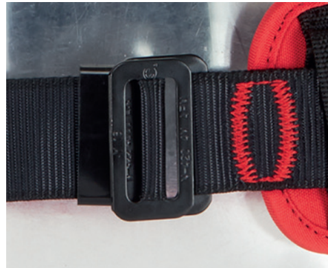
Pass through buckles