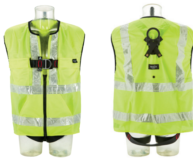
3M™ Protecta® Standard Vest Style Fall Arrest Harness with Hi-Visibility Vest