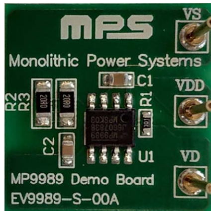
(L x W) 2.2cm x2.2cm