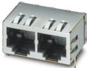
RJ45 PCB connectors, degree of protection: IP20, 10 Gbps

Please be informed that the data shown in this PDF Document is generated from our Online Catalog. Please find the complete data in the user's documentation. Our General Terms of Use for Downloads are valid ( http://phoenixcontact.com/download )