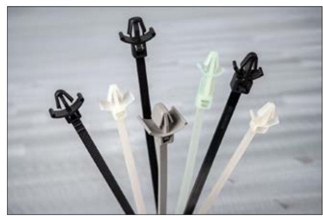
A wide range of arrowhead fixing ties which are suitable for different panel thicknesses and hole diameters.