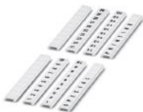
Zack marker strip flat, 10-section, horizontally labeled with the consecutive numbers: 61 ... 70, white

Please be informed that the data shown in this PDF Document is generated from our Online Catalog. Please find the complete data in the user's documentation. Our General Terms of Use for Downloads are valid ( http://phoenixcontact.com/download )