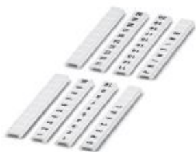
Zack marker strip flat, 10-section, horizontally labeled with the consecutive numbers: 81 ... 90, white

Please be informed that the data shown in this PDF Document is generated from our Online Catalog. Please find the complete data in the user's documentation. Our General Terms of Use for Downloads are valid ( http://phoenixcontact.com/download )